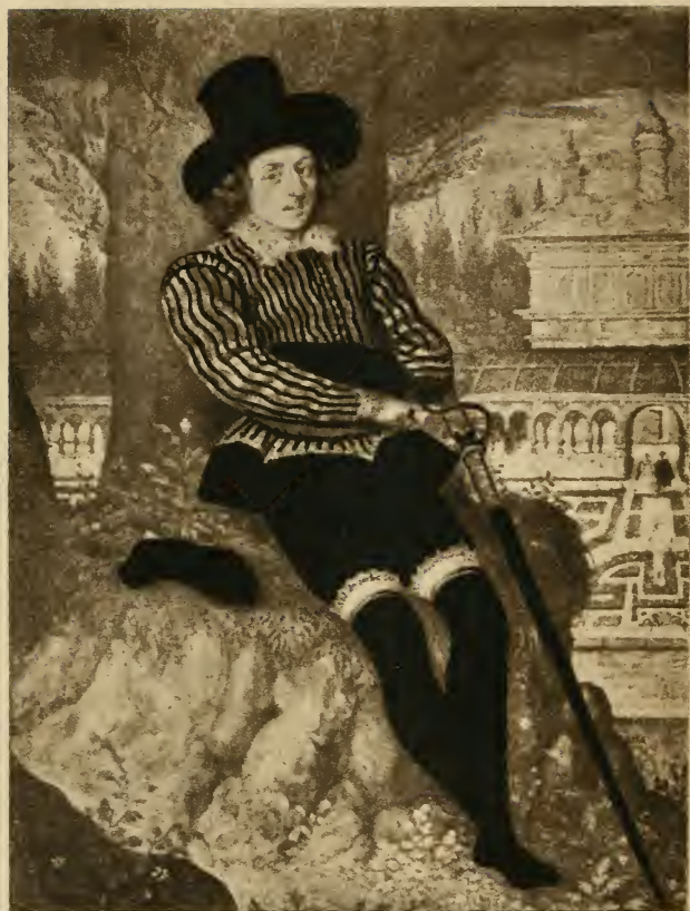
Sir Philip Sidney Author of 'The Arcadia' After the miniature by Isaac Oliver